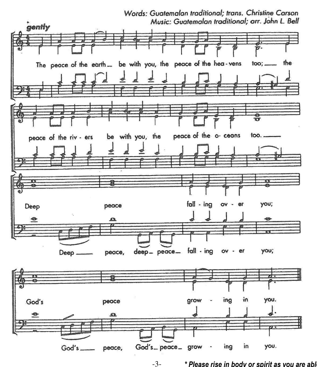
* Please rise in body or spirit as you are able

The peace of the earth be with you, the peace of the heavens too The peace of the rivers be with you the peace of the oceans too Deep peace, falling over you; God's peace, gro-o-wing in you.