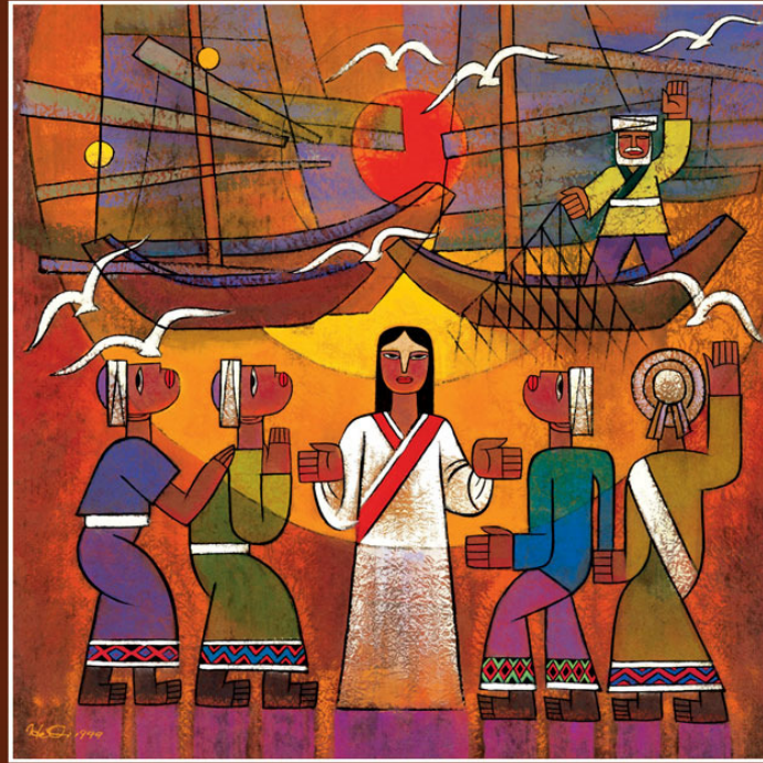
"Jesus Calling the Disciples" by Qi He